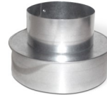
RX24 Cap Reducer no crimp